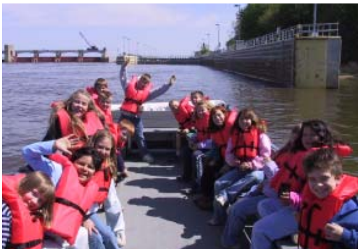
Blue Heron Eco Cruise on the Mississippi River

THUMBS UP TO the Clinton County Enviro Kids program and its many corporate sponsors, for doing such a good job of providing local students the opportunity to see first hand the kind of environmental education most children are lucky to get in the classroom.